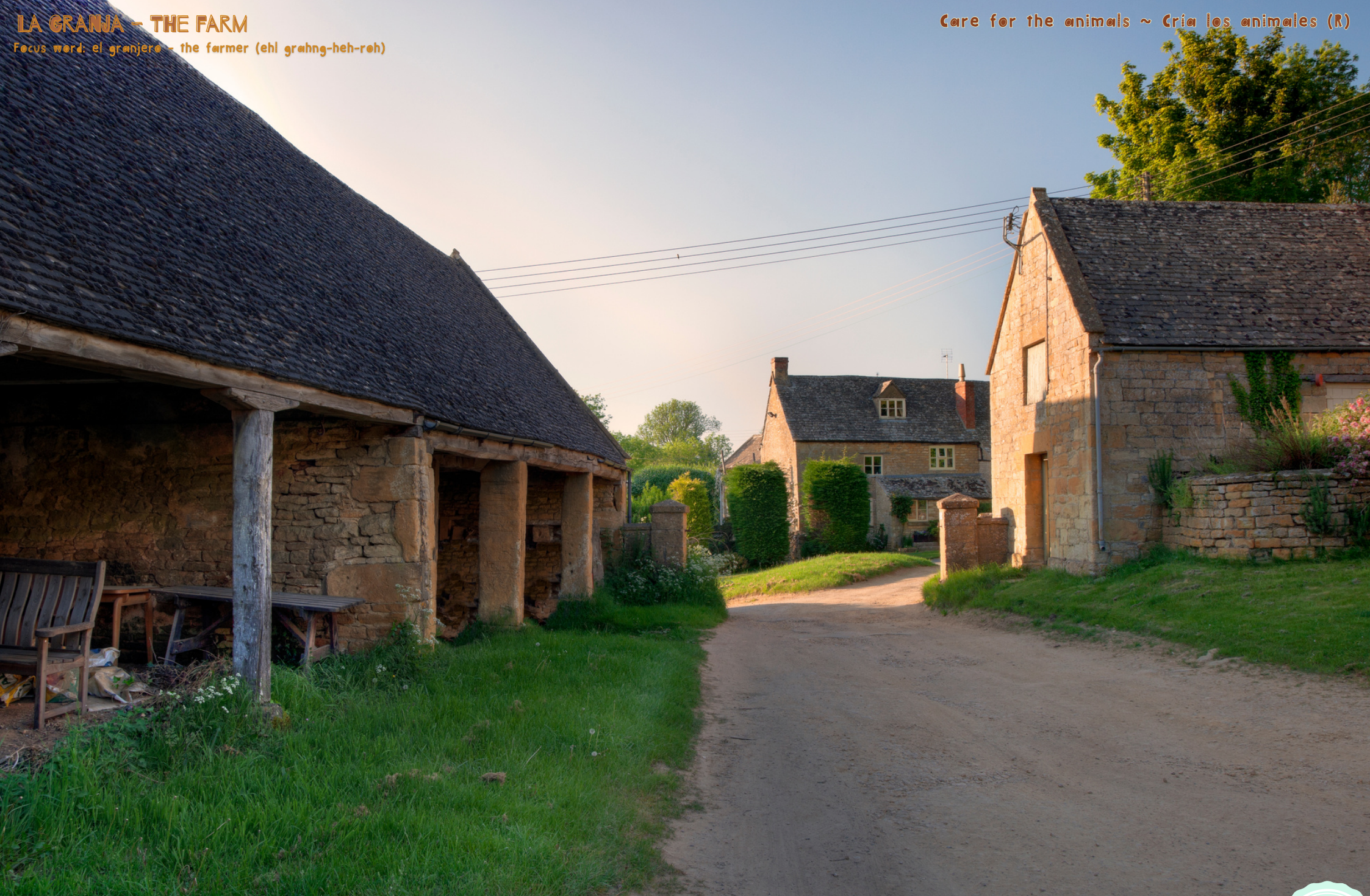
THE FARMYARD ~ EL CORRAL (EHL KOH-RR AHL)